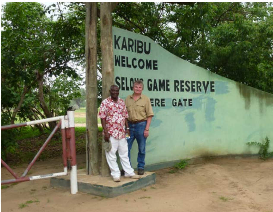
Top: The reserve's game scouts bear the burden of the fight against elephant poachers.