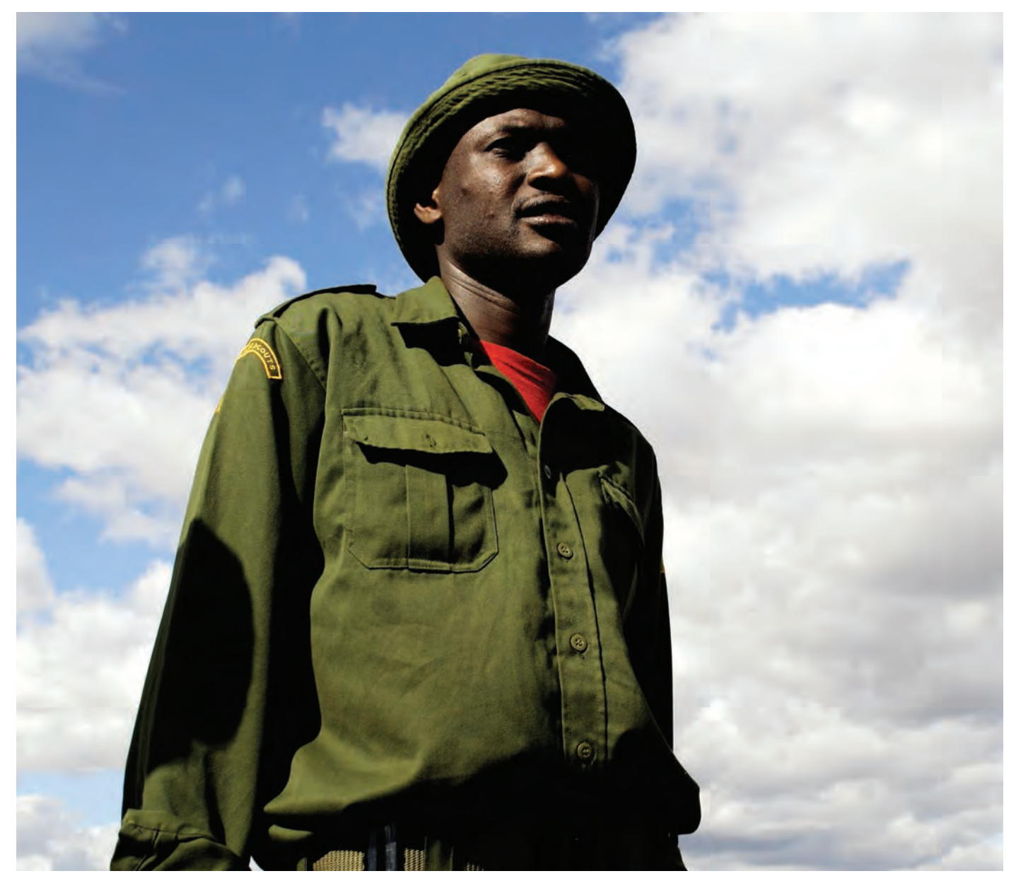
Day to day monitoring of wildlife resources in the WMA requires a well-trained, equipped and vigilant village game scouts

Anti-Poaching Support: Protecting the wildlife is a critical role of the AA. WMA money has been used to select and train village game scouts, and equip them with boots, uniforms, radio, vehicles and guns.