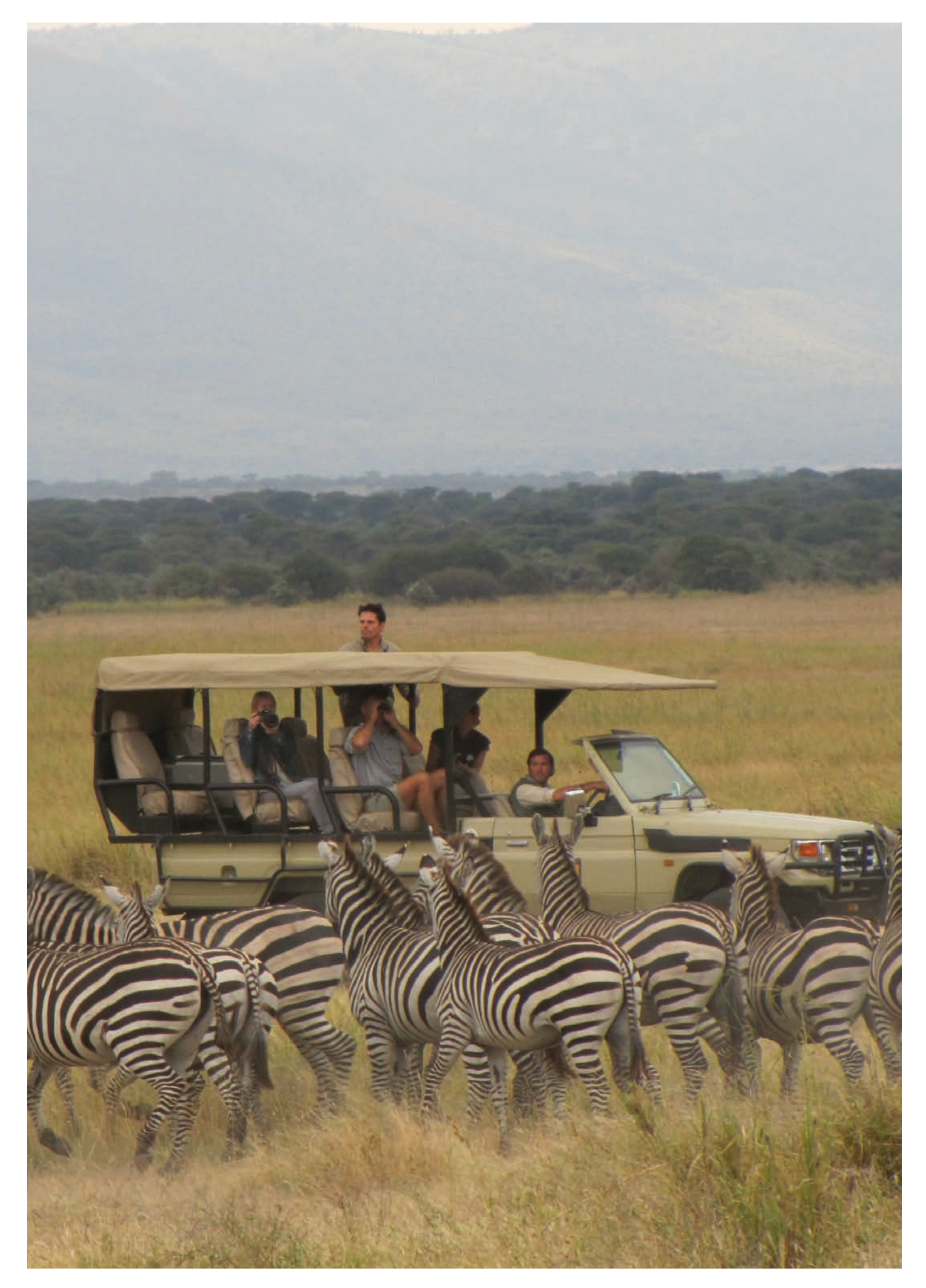
WMAs do equally provide opportunities for photographic safaris just like national parks.