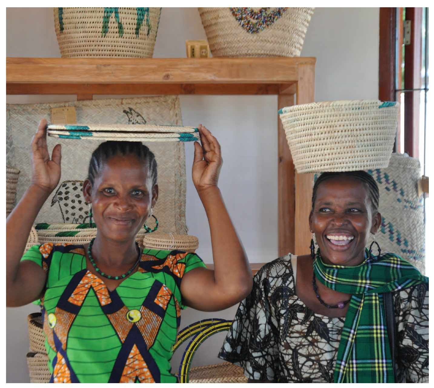
WMAs have provided more livelihood opportunities for women groups by availing markets for handcraft products