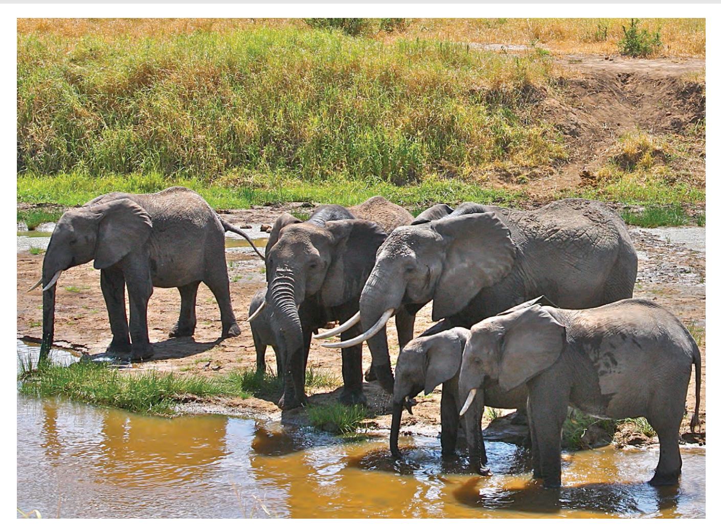
Protection of a healthy wildlife population calls for committed and motivated village game scouts.

Are visitor's numbers increasing or decreasing? Are tourist revenues increasing or decreasing? Are construction targets on schedule? How well are business agreements being kept by both sides? What progress has there been in managing conflict? Is the agreed number of people being employed in Joint Venture Businesses? How many people are earning money from tourist related activities?