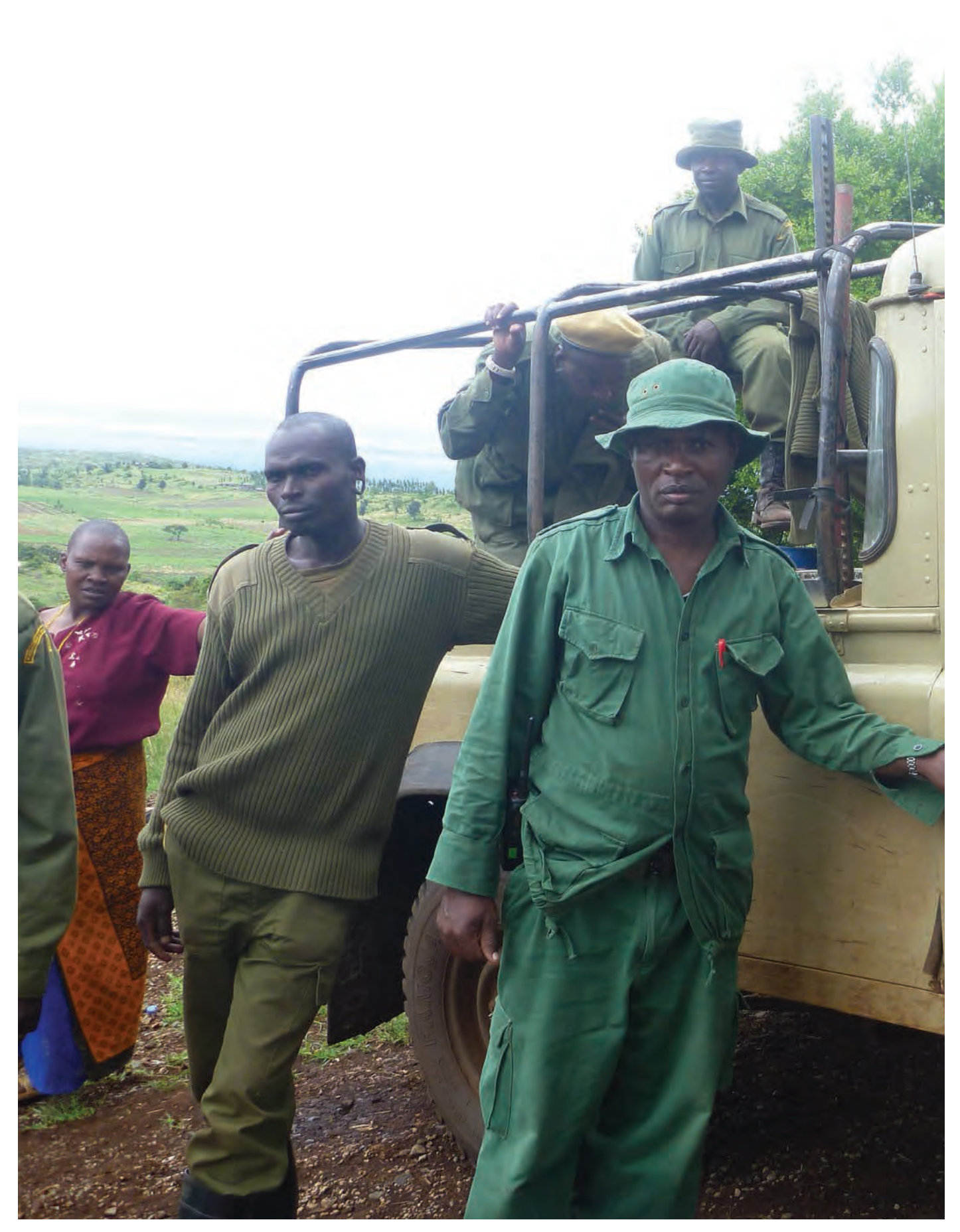
Village game scouts requires facilitation for effective patrols, a car is vital.