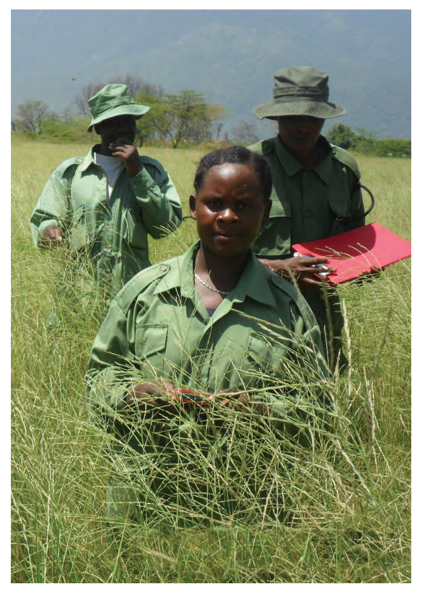
Village scouts on a field practical training and anti-poaching, women can do it too