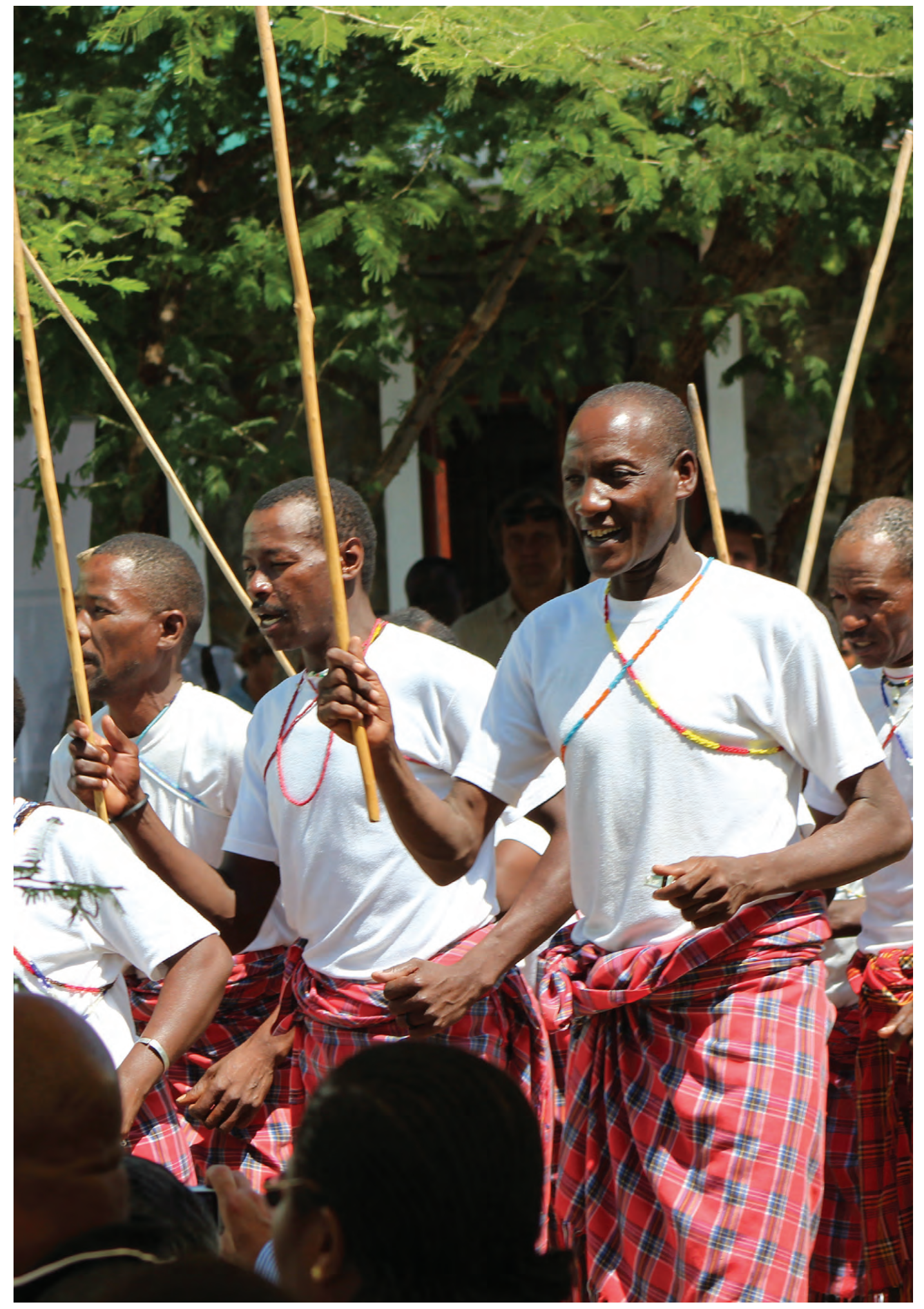
WMA diversifies income opportunities through cultural tourism.