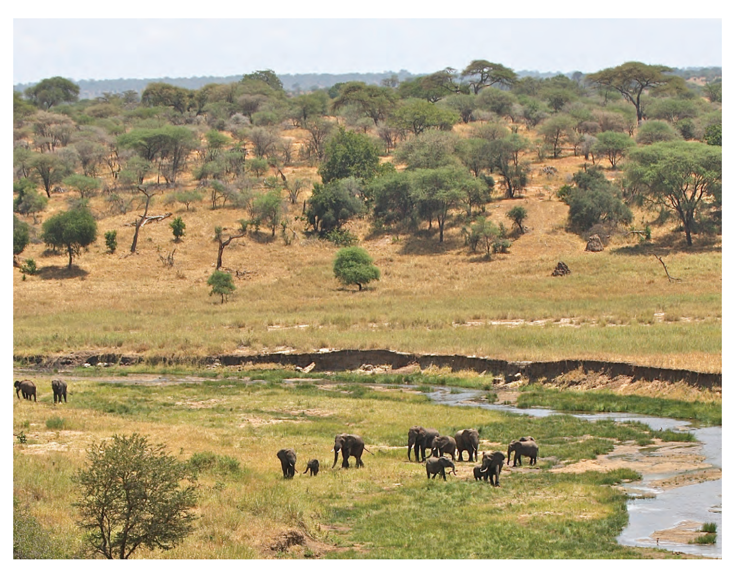
Effects of good land use plan spills over beyond target areas; River Tarangire has its source in Kondoa but pouring its waters in Lake Burunge.

You can make changes to your constitution: but if you do so they will need to be agreed again by the whole community.