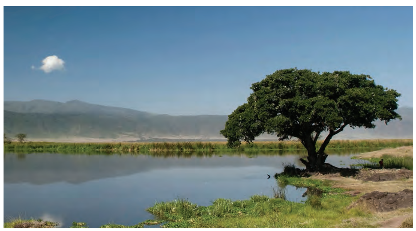
Water is vital for wildlife, sources like this one outside national park are protected under the WMA.

When considering which business to start, remember to explore fresh and innovative ideas. Tourist businesses do not have to be limited to camps and lodges. Visitors from overseas are also looking for active and entertaining experiences, such as herding with pastoralists, riding camels, kayaking, or visiting a boma. Many like to learn new skills or see how local crafts are practiced. You might teach traditional dance or music, or offer classes to visitors in pottery making, beadwork or other crafts. The human skills in your area are as important as the lions and elephants, mountains and forests! Look at the box below for some more details.