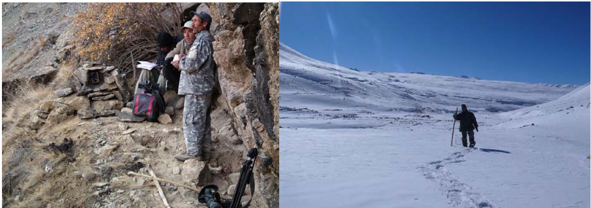
Fig. 36 and 37: Camera trap survey – Ravmeddara and winter survey - Alichur