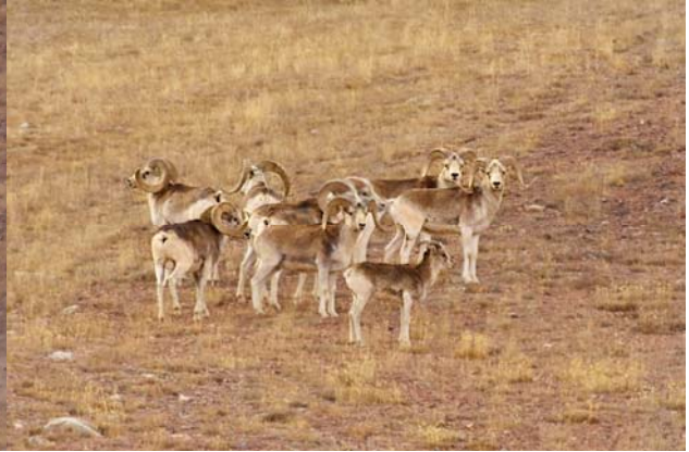
Fig. 28 and 29: Marco Polo sheep – Private hunting concession “Murghab”