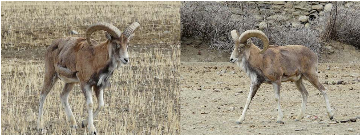
Fig. 32 and 33: The last Ladakh urial near Ishkashim 2010 and 2011