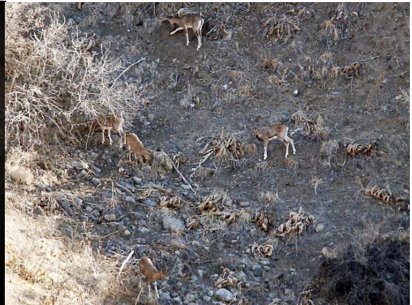
Fig. 30 and 31: Bukhara urials – Siyorish (“Morkhur” Ltd.) and Hazratishoh (NGO “Muhofiz”)