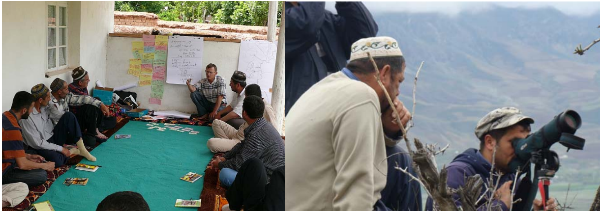
Fig. 8 and 9: Community meeting and joint survey, NGO “Muhofiz”, Hazratishoh