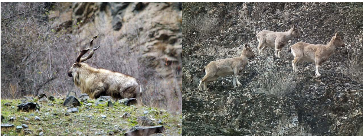
Fig. 24 and 25: Tajik markhor – Zighar