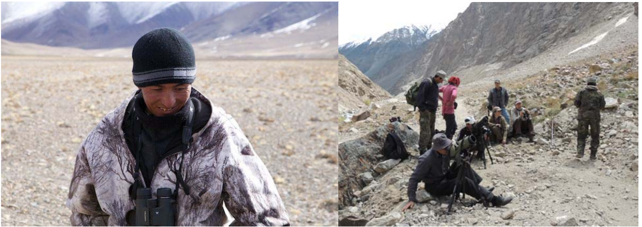
Fig. 15 and 16: Community ranger, NGO “Burgut” – Alichur and ibex observation with NGO “Parcham” - Ravmeddara