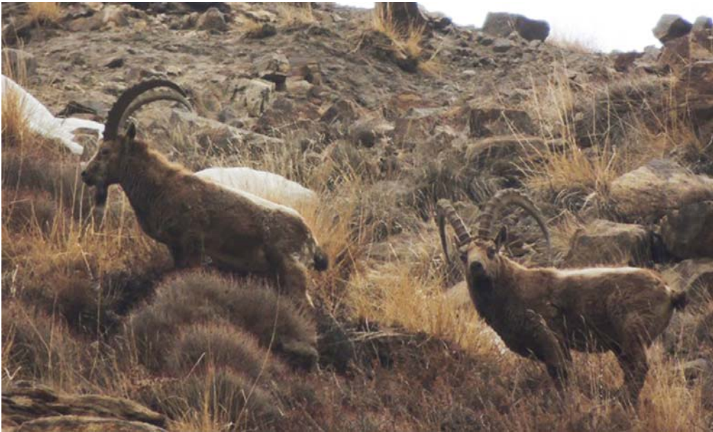
Fig. 21: Siberian ibex - Darshaydara