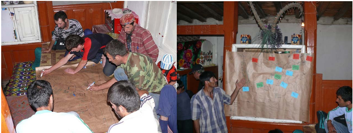
Fig 3 and 4: Community meeting in Ravmeddara