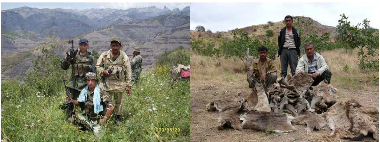
Fig. 13 and 14: Skins of poached markhor and urial were confiscated, Rangers of “Morkhur” Ltd. and Strict Nature Reserve Dashtijum, Border forces Tajikistan