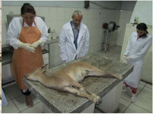
Fig. 26 and 27: Tajik markhor – Zighar, S-Darvaz range and necropsy after Mycoplasma pleuropneumonia outbreak