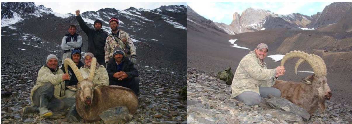
Fig. 42 and 43: Rangers from NGO Parcham with first happy hunting client – Ravmeddara