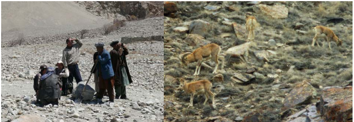
Fig. 34 and 35: Search for urial in the Wakhan Afghanistan, Ladakh urial, Baroghil Afghanistan