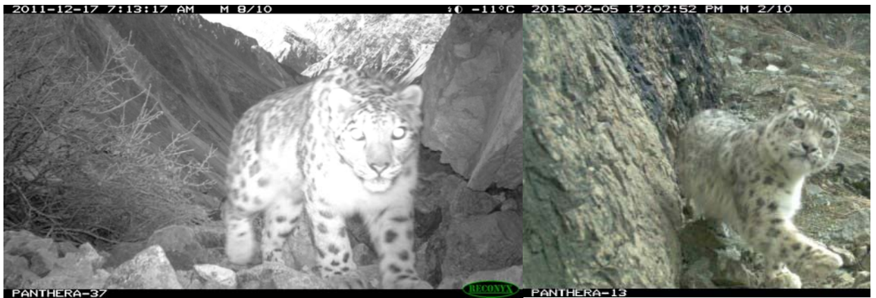
Fig. 50: Snow leopards benefit from sustainable use of prey species –Ravmeddara and Zighar