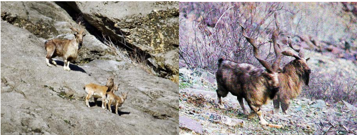
Fig. 22 and 23: Tajik markhor – Zighar