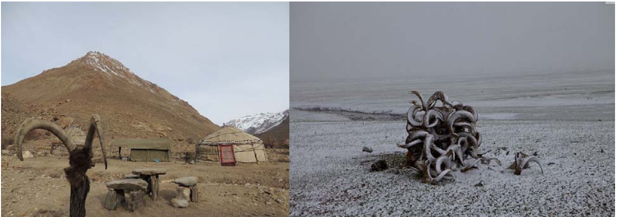
Fig. 48 and 49: Hunting camp of NGO “Yoquti Darshay” – Darshaydara; argali horns – Eastern Pamirs