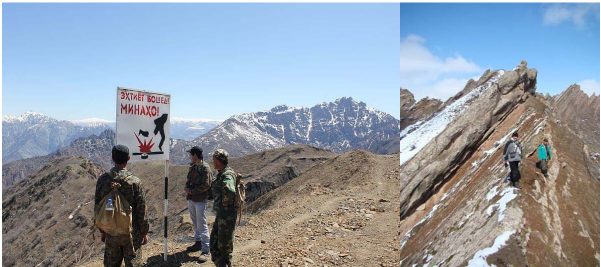
Fig. 11 and 12: Markhor survey in area with land mines and other difficulties - Siyorish