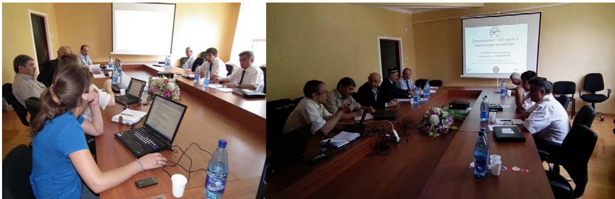
Fig. 40 and 41: Discussion of draft hunting laws by collaborators of state agencies and Deputies of the Parliament of Tajikistan