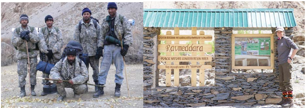
Fig. 6 and 7: Community rangers of NGO “Parcham”, entrance of conservancy - Ravmeddara