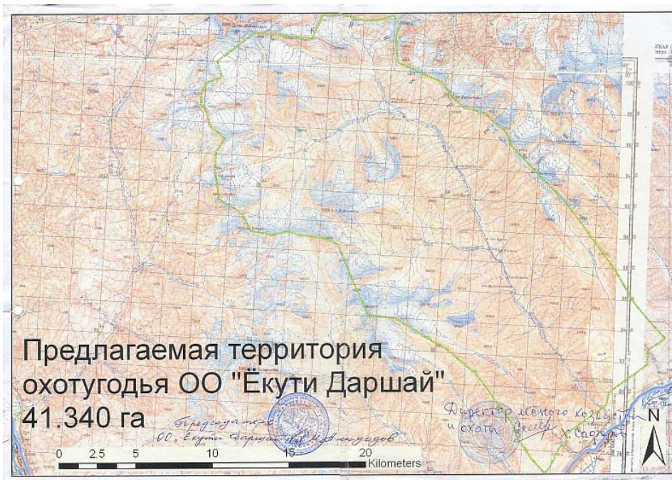
Fig. 5: Map of wildlife management area of NGO “Yoquti Darshay” with official confirmation - Darshaydara