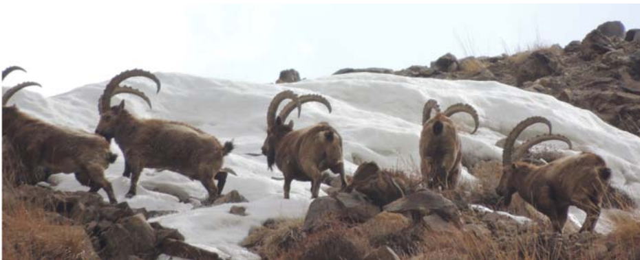
Fig. 2: Siberian ibex - Darshaydara