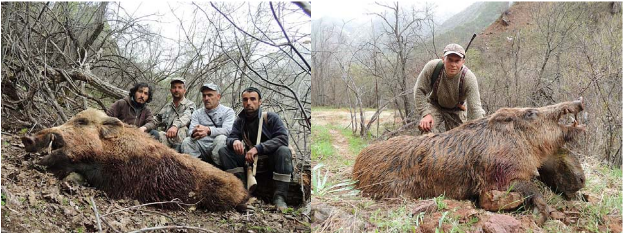
Fig. 46 and 47: Wild boar hunt finances markhor conservation, NGO “Muhofiz” - Hazratishoh