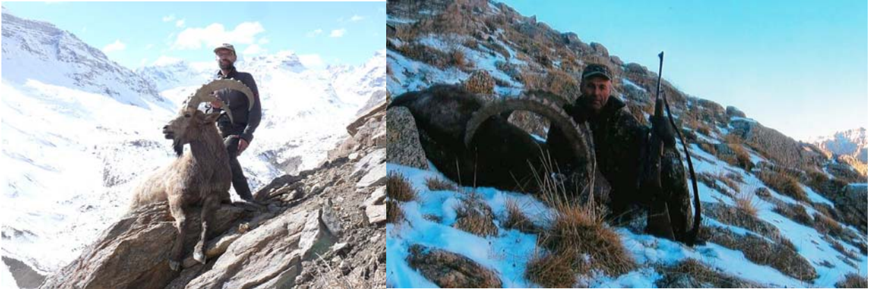
Fig. 44 and 45: Successful ibex hunters - Darshaydara