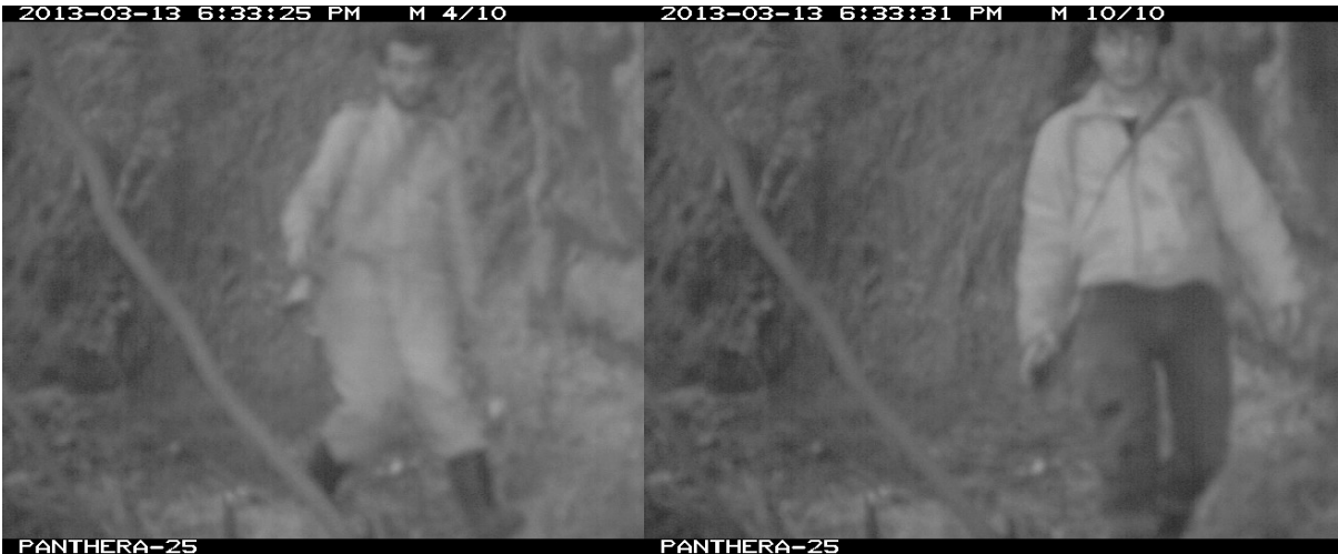
Fig. 17 and 18: Poachers caught on camera traps; they will not come there again! - Zighar