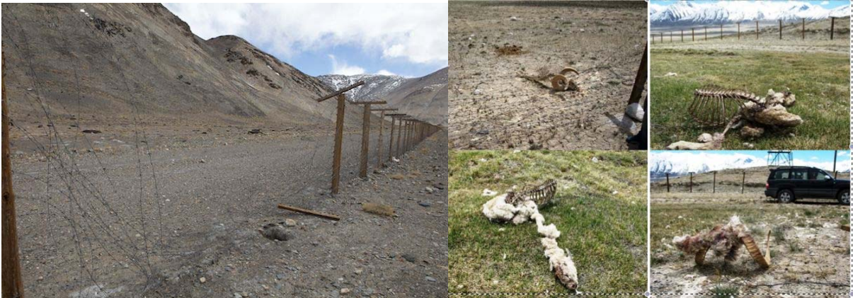
Fig. 19 and 20: Partly destroyed border fence and resulting mortality among Marco Polo sheep – Eastern Pamirs